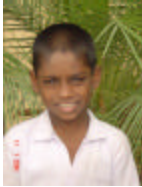
B h i m

Phone: 091-11-2222165 Mobile: 9818307480 E mail: ashraybhavan@vsnl.net